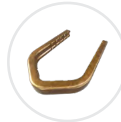
True M/L clip